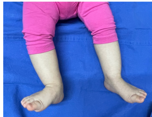
FIGURE 2 Recovered active ankle dorsiflexion and foot eversion after 5 months.

At the 4 months of follow-up, the physician observed voluntary active ankle dorsiflexion and foot eversion with normal EHL