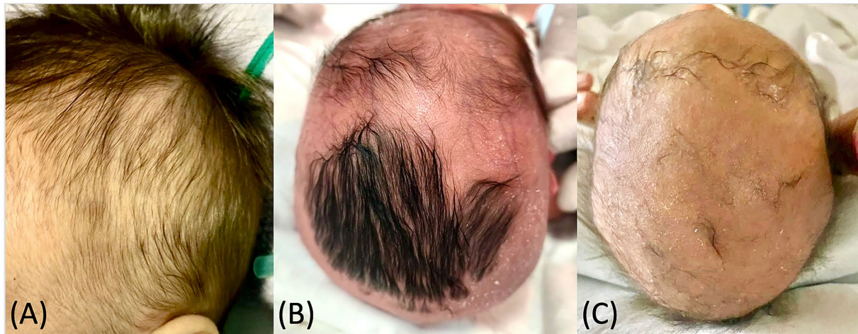
FIGURE 1 Clinical photographs of neonates with syphilitic alopecia: (A) neonate boy with small “moth-eaten” pattern patches; (B) neonate boy with patchy alopecia in a halo-ring pattern; (C) neonate boy with extensive patchy alopecia involving almost the entire scalp.