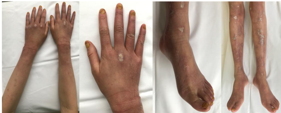
FIGURE 3 Evident regression of the cutaneous lesions of the patient's arms, hands, legs, and feet after the antiplatelet therapy.