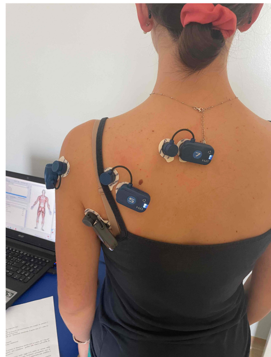
FIGURE 2 Example of positioning of the electromyographic probes (photograph obtained with the consent of the portrayed subject).