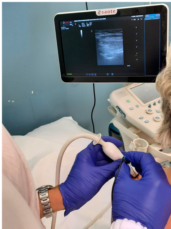
FIGURE 1 Performing pulsed radiofrequency treatment of the left suprascapular nerve (photograph obtained with the consent of the portrayed subject).