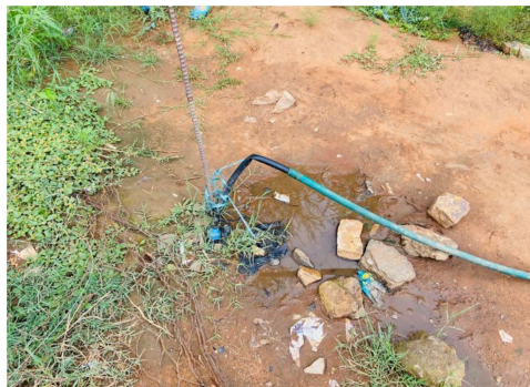
FIGURE 2 Illegal connection of water pipes.