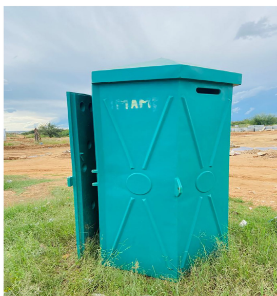
FIGURE 3 Shared bucket toilet facility.

and children. Respondents highlighted irregular servicing cycles, persistent overflows, and pervasive odours, conditions that mirror national critiques of the bucket system's impact on public health and human dignity (Ferronato and Torretta, 2019).